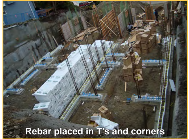
Rebar placed in T's and corners