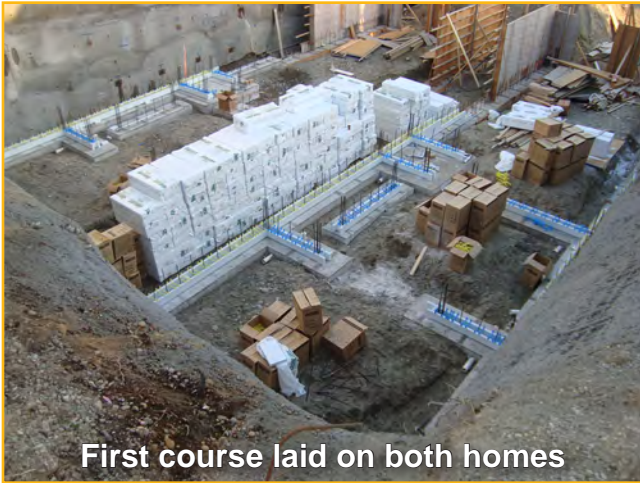
First course laid on both homes