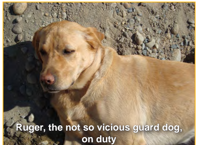
Ruger, the not so vicious guard dog, on duty