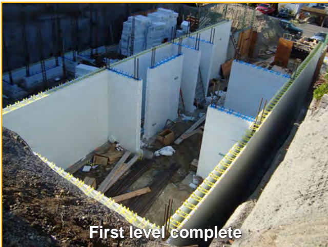
First level complete