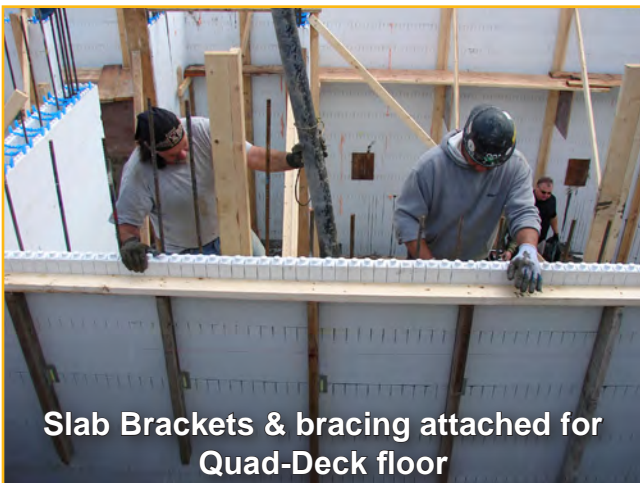
Slab Brackets & bracing attached for Quad-Deck floor