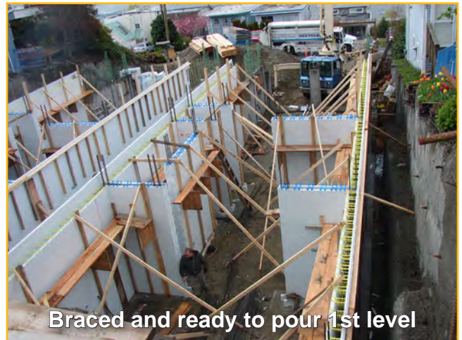
Braced and ready to pour 1st level